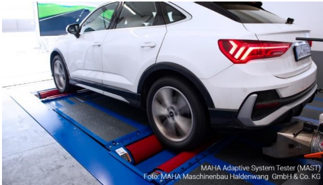
MAHA Adaptive System Tester (MAST)